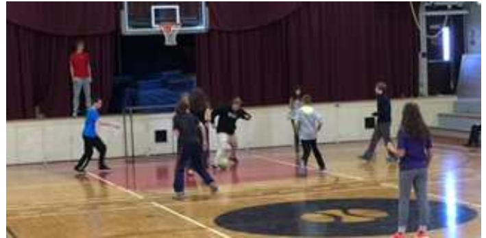
Interactive Phys. Ed class