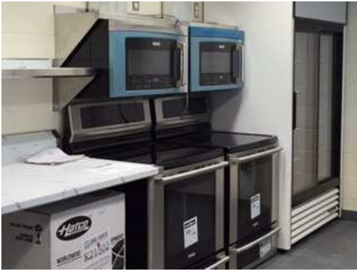
Food services and eating areas taking shape