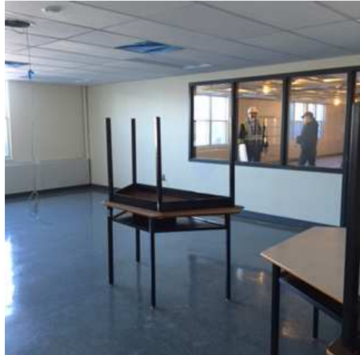
Seminar Room (left) and Library (right) will soon be finished